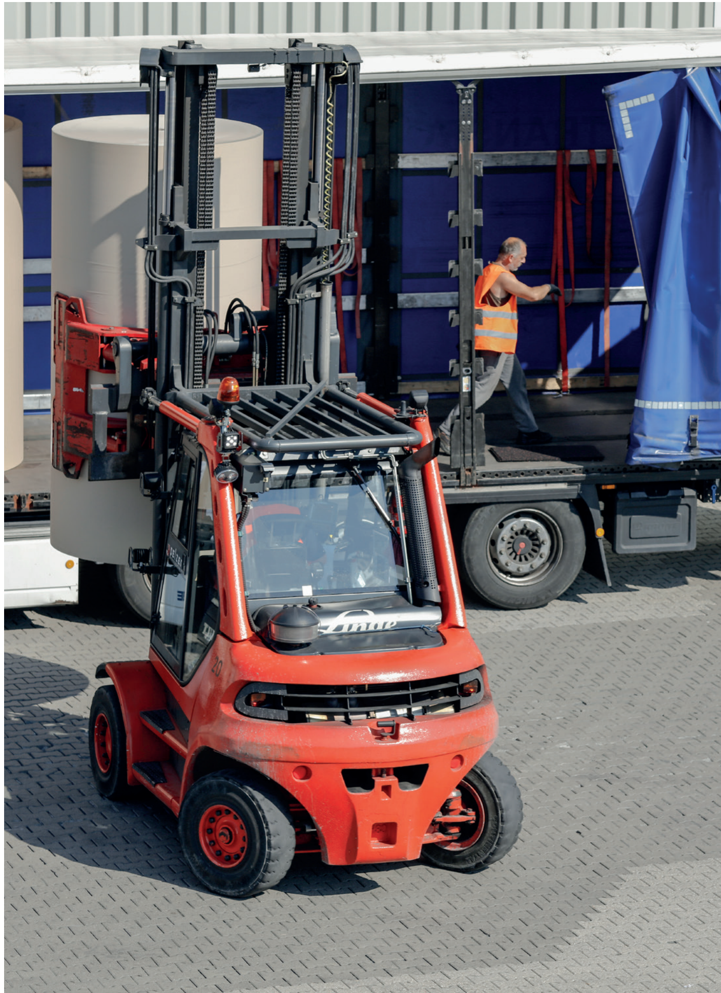
During loading and unloading, people and vehicles work closely together. The earlier hazards are detected, the more secure is the process.